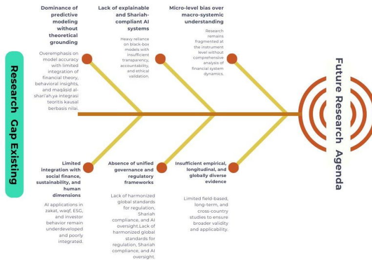
Figure 3. Research Gap dan Future Research

Sixth, the lack of empirical, longitudinal, and globally representative research designs. Most existing studies rely on retrospective datasets and simulation-based approaches, with limited real-world validation. In addition, the geographical concentration of research in Southeast Asia and the GCC highlights a contextual imbalance. Future research should prioritize field-based and longitudinal studies, industry collaboration, and cross-country comparative analyses to enhance external validity and global relevance.