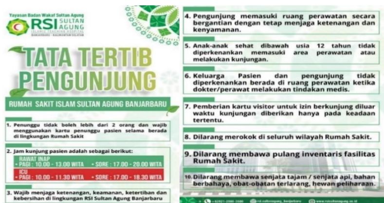
Figure 6. Visitor Code of Conduct for Sultan Agung Islamic Hospital Banjarbaru

Provisions related to service number 8), namely the hospital, patient and person in charge of the patient must embody good morals, based on the results of interviews that researchers obtained directly at RSUD Brigjend H Hasan Basry Kandangan, regarding these provisions it is known that the hospital has implemented regulations on patient education and family involvement in the patient's healing process. Educational materials on family participation in the patient's healing process and medical record forms on recording patient education and family involvement have also been implemented even though the implementation is still not optimal, because administrative matters are sometimes still not paid attention to by patients, but it is still being strived to be able to achieve maximum in recording.