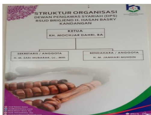
Figure 7. Organizational Structure of DPS Brigjend H Hasan Basry Hospital Kandangan