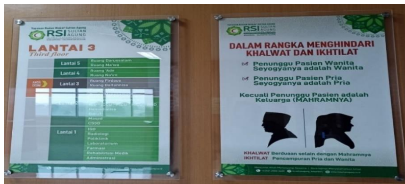
Figure 3. Information on Khalwat and Ikhtilat