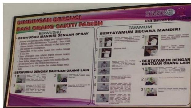
Figure 2. Purification Guidance for the Sick/Patient