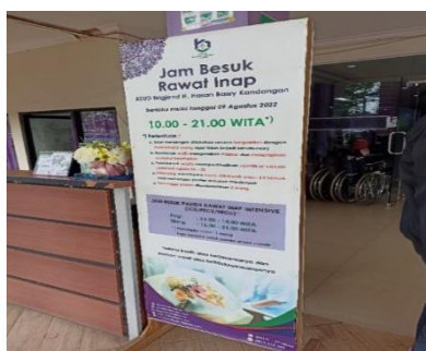
Figure 5. Visiting Hours at Brigjend H Hasan Basry Kandangan Hospital

Provision related to service number 7) is that the patient and the person in charge of the patient must comply with all applicable regulations and procedures in the hospital. This provision can be ascertained to have also been implemented because RSUD Brigjend H Hasan Basry Kandangan and RSI Sultan Agung Banjarbaru already have regulations and procedures that are determined to be obeyed by patients and patient carers, one of which is regarding the provisions of patient visits and watches, which are explained in detail by the following image.