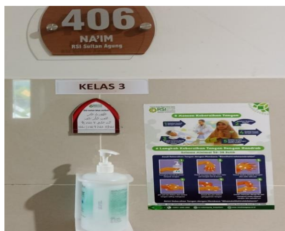
Figure 4. Information on Hand Hygiene by Reading Bismillah and Hamdalah