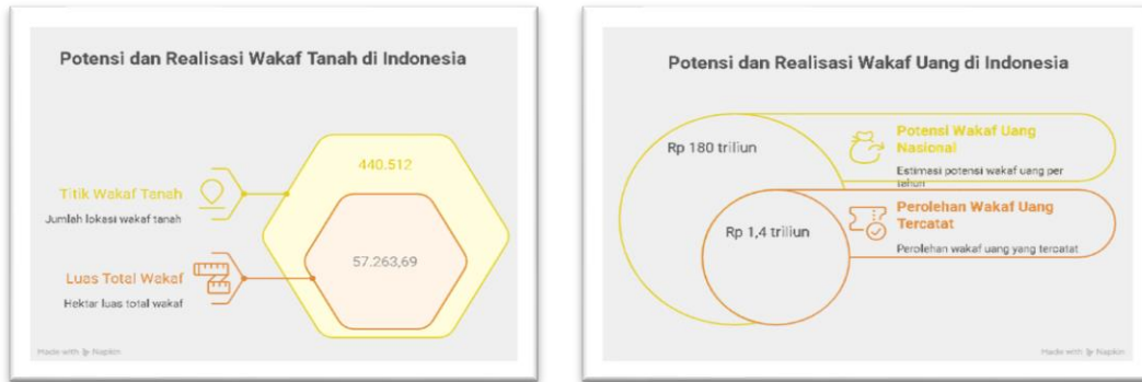
Figure 1. Comparison of the Potential and Realization of Land and Money Waqf in Indonesia

The reported productive waqf ratio of only 0.411 shows that the productivity aspects and social benefits of waqf are still very limited. 5